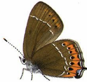
Image reproduced from the CD-ROM Guide to British Butterflies, drawn by Richard Lewington

There is open access to Glaphorn Cowpasture Reserve which is accessed off the minor road between Glaphorn and Upper Benefield, northwest of Oundle. Park sensibly in the lane opposite the wood and please record all butterfly observations in the log located by the observation tower.