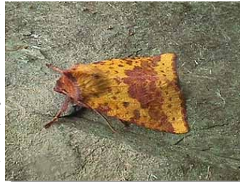
Pink-barred Sallow

About a dozen people, young and old alike, attended this event led by Colin Plant and Ray Uffen in Hertfordshire's only NNR at Broxbourne Woods. An initial introduction to the types of leaf-mines to look for was followed by searching trees and shrubs along a path near the car park for potential species. A number were identified on the spot by the experts. After lunch Colin set up a microscope in his campervan to enable attendees to examine the finer points of leaf-mines such as frass patterns, eggs and cocoons. A number of species were collected and were identified by Colin as follows: