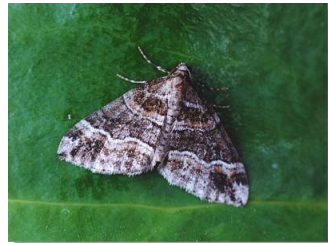
Barred Rivulet