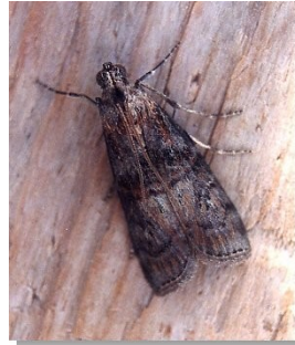
Phycita roborella

Large Yellow Underwing Lesser Yellow Underwing Lesser Broad-bordered Yellow Underwing Setaceous Hebrew Character Square-spot Rustic Common Wainscot Deep-brown Dart Black Rustic Lunar Underwing Pink-barred Sallow Sallow Copper Underwing Angle Shades Rosy Rustic Bulrush Wainscot Vines Rustic Snout