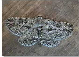
Willow Beauty © Ian Kimber