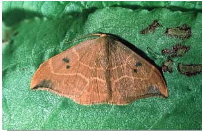
Oak Hook-tip © David Painter