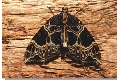
Small Phoenix © David Painter