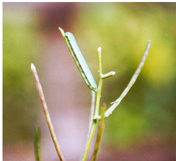
One of the Orange Tip larvae on a 'protected' plant

I am only a casual observer but I conclude that if other individuals protected Orange Tip eggs each Spring in a similar manner then come the following year there would be more than the odd extra butterfly about. Of all the 40 wild eggs I found, only one managed to survive.